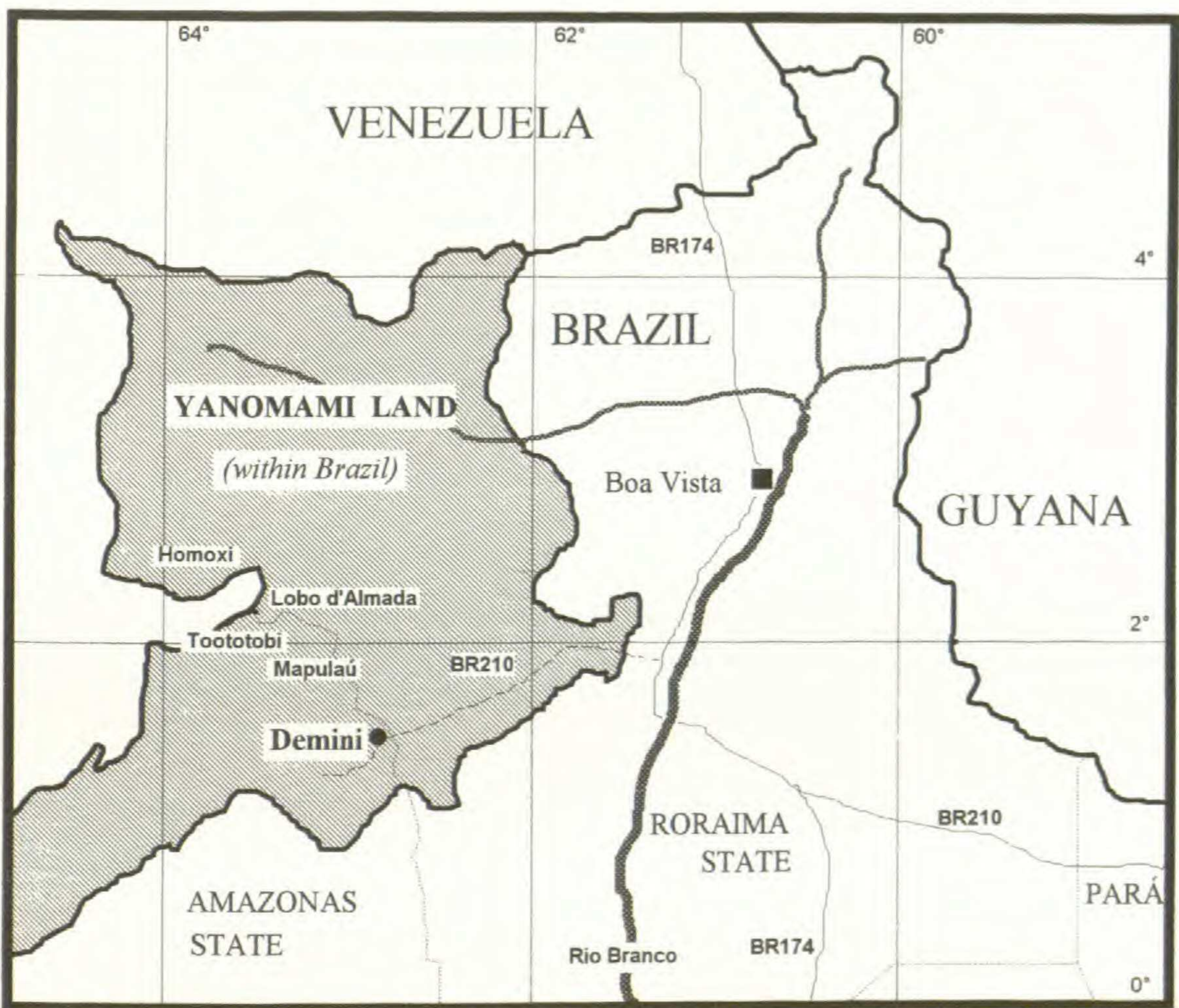
FIGURE 1.—Approximate location of the study area (Demini FUNAI Post)

almost two years had lapsed since termination of the construction of the new round-house, many of its inhabitants were able to identify without difficulty the types of trees from which each of the components of the house had been made. A comprehensive inventory of those tree species was carried out, and notes were made on the construction techniques and details, the results of which are presented here. Although the structure of some Yanomami dwellings has been described in various parts of their territory (Chagnon 1968; Fuerst 1967; Lizot 1984), and some of the principal construction materials used in those areas have been catalogued (Fuentes 1980; Lizot 1984), this is the first complete and quantitative inventory to have been carried out.